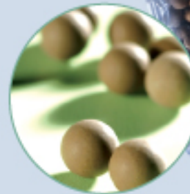
SE Ceramic Ball